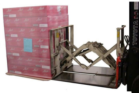
The Roller-Fork System